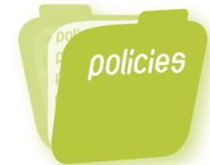
Policies on Volunteer Centers