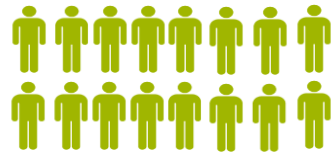
15-16 Experts on VMS and ICS