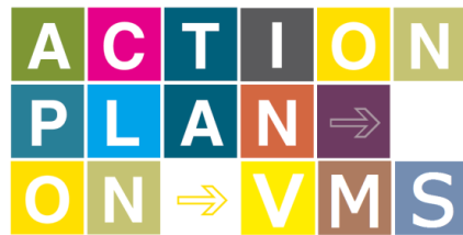
Solid Action Plan on VMS