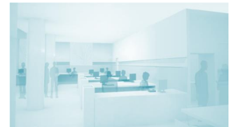
A Volunteer Center