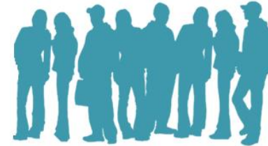
Core Group of Volunteer Managers