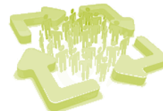
A Mobilization and Coordination Plan